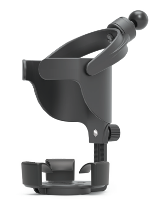
RAP-B-417BU RAM® Level-Cup™ XL 32oz Cup Holder

VISIT RAMMOUNT.COM/HOLDERS TO VIEW ALL DEVICE HOLDERS