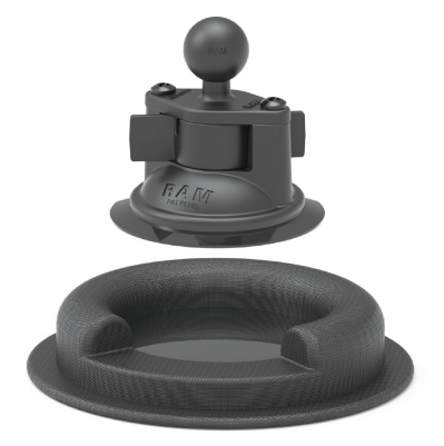
RAM-B-224-1U + RAP-279C Suction Cup Base with 6.5" Weighted Platform Base