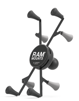
RAM-HOL-UN8BU RAM® X-Grip® 7"-8" Tablet Holder