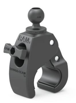
RAP-B-404U RAM<sup>®</sup> Tough-Claw<sup>™</sup> 1" - 1.88" Clamp Base