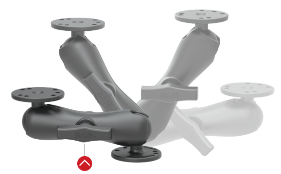
Easy to adjust knobs allow for loosening and tightening of arms and mounts

Ensure your phone or tablet is at the precise angle you need—depending on the mounting base, these systems feature near-infinite adjustability. With the twist of a knob, position your mount exactly where you need it.