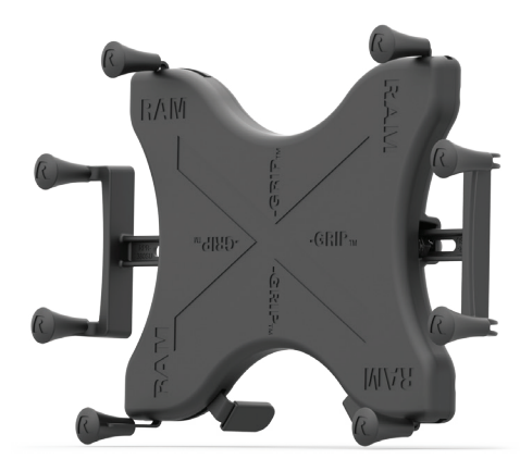
RAM-B-202-UN9U RAM<sup>®</sup> X-Grip<sup>®</sup> 9"-11" Tablet Holder

VISIT RAMMOUNT.COM/HOLDERS TO VIEW ALL DEVICE HOLDERS