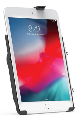
RAM-HOL-AP24U iPad Pro 12.9" 3rd Gen